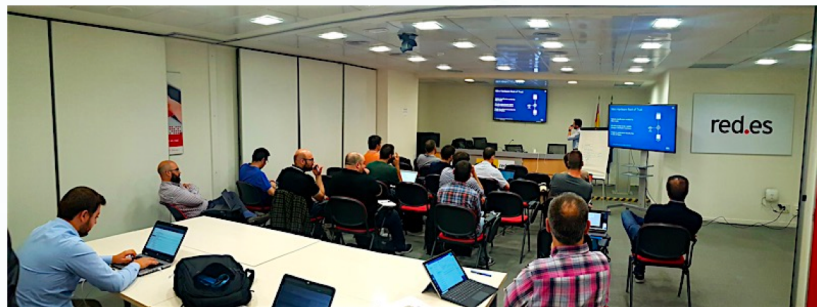
AWS workshop - May 2019